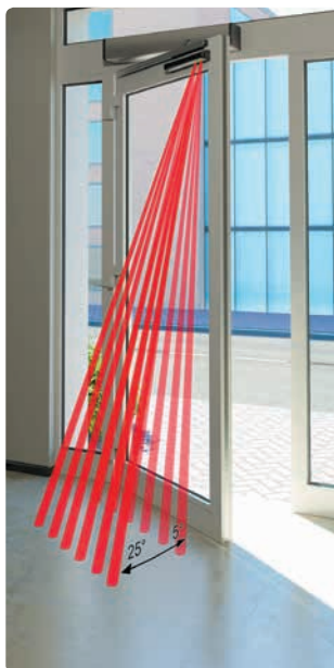
Detection Area Angle Adjustment