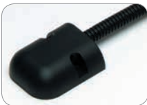
Cabling Kit for the SSS-5