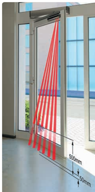
Detection Area Distance Adjustment