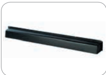
SSS-5 WC Black Weather Cover 700mm in length