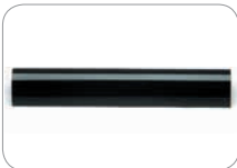
Filter Cover for SSS-5